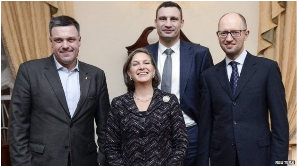
Leader of Ukraine's Neo-Nazi Party Svoboda Oleh Tyahnybok (Left) with Victoria Nuland, Former PM of Ukraine Arseniy Yatsenyuk

Hillary Clinton famously claimed that she is under attack from a "vast right-wing conspiracy". In truth, Hillary Clinton is a right-wing conspiracy.