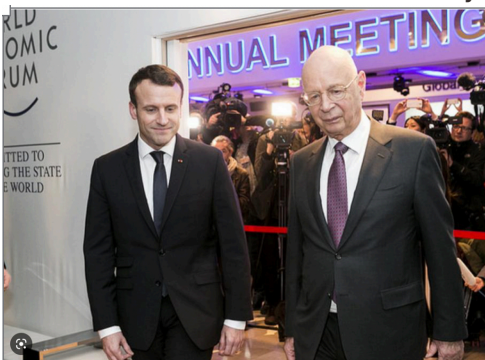
Macron unveils bold, inclusive agenda for globalization - Saudi Gazette

Emmanuel Macron is not only a protégé of The Rothschilds, he is also a WEF