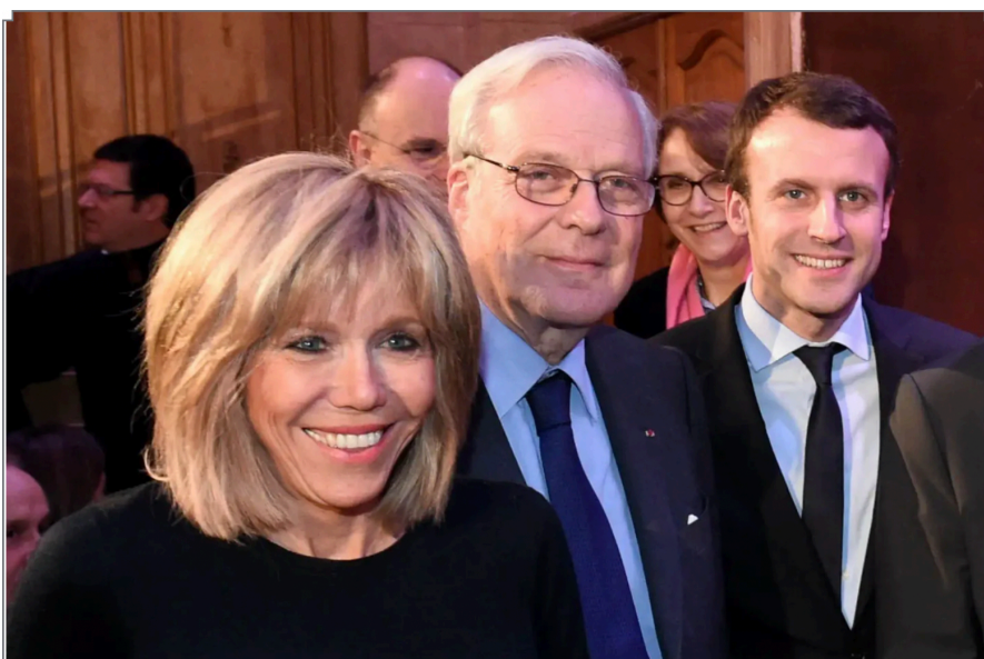
■ Brigitte Macron, le Baron David de Rothschild et Emmanuel Macron, en février 2016.

Emmanuel Macron is a former “investment banker” and obedient servant of LCF Rothschild . He does not represent the citizens of the French Republic.