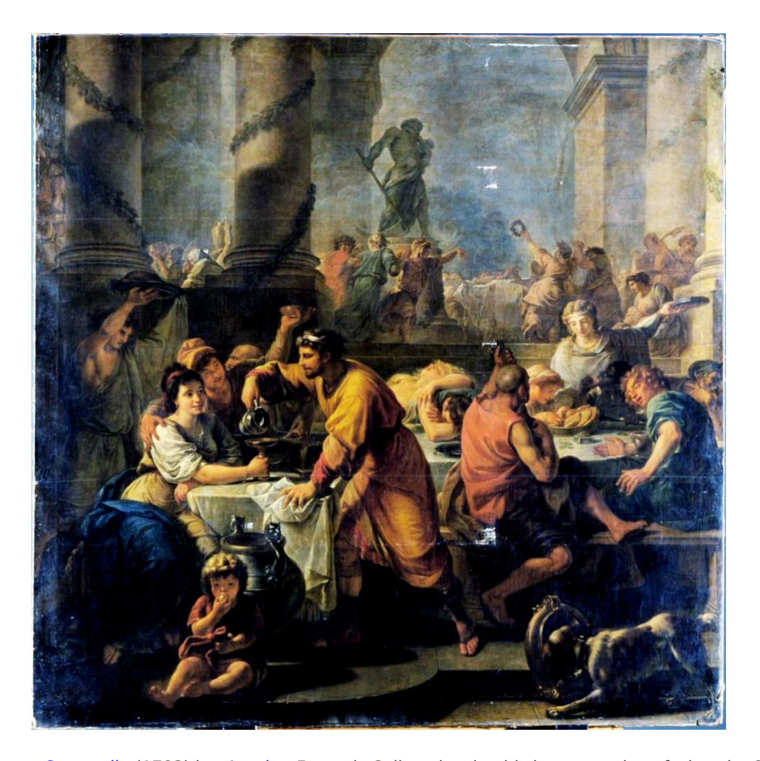
Saturnalia (1783) by Antoine-François Callet, showing his interpretation of what the Saturnalia might have looked like

The Lord of Misrule, appointed to be in <u>charge</u> of Christmas partying at court, universities, and in the great houses of the nobility was similar to the mock king of the Roman feast of Saturnalia when social mores were turned upside down for the duration of the festivities (probably as a form of social catharsis). [4]