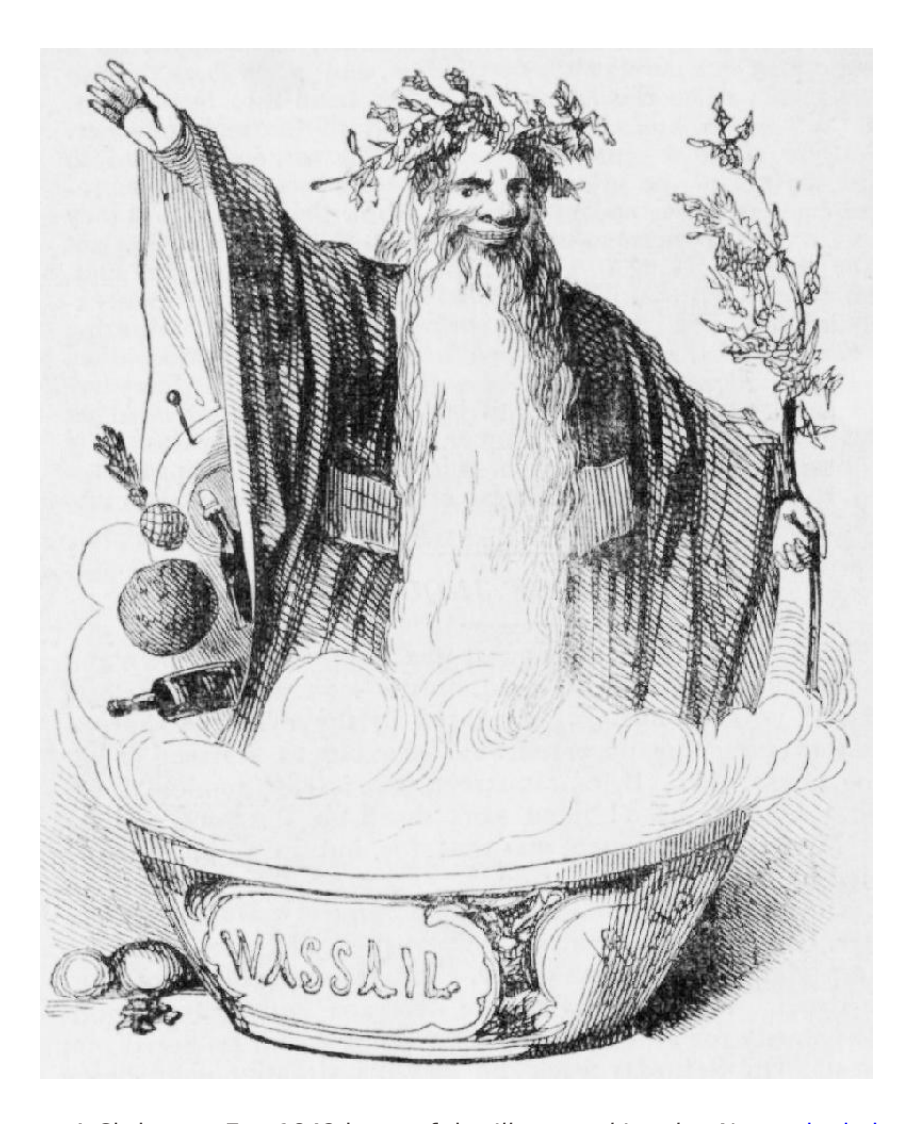
A Christmas Eve 1842 issue of the Illustrated London News , <u>depicting</u> Father Christmas in a wassail bowl.

Father Christmas is the traditional English name for the personification of Christmas. In pre-Victorian times "Father Christmas had been concerned essentially with adult feasting and games. He had no particular connection with children, nor with the giving of presents." Father Christmas had been around since at least the fifteenth century whereas the popular American Santa Claus arrived in England in the 1850s and soon "distinctions between Father Christmas and Santa Claus largely faded away in the early years of the 20th century."