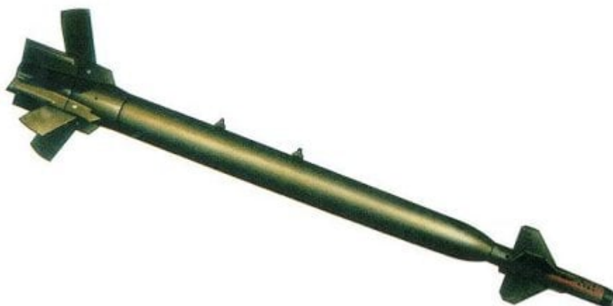
Gbu 28 Guided Bomb Unit-28 (GBU-28)