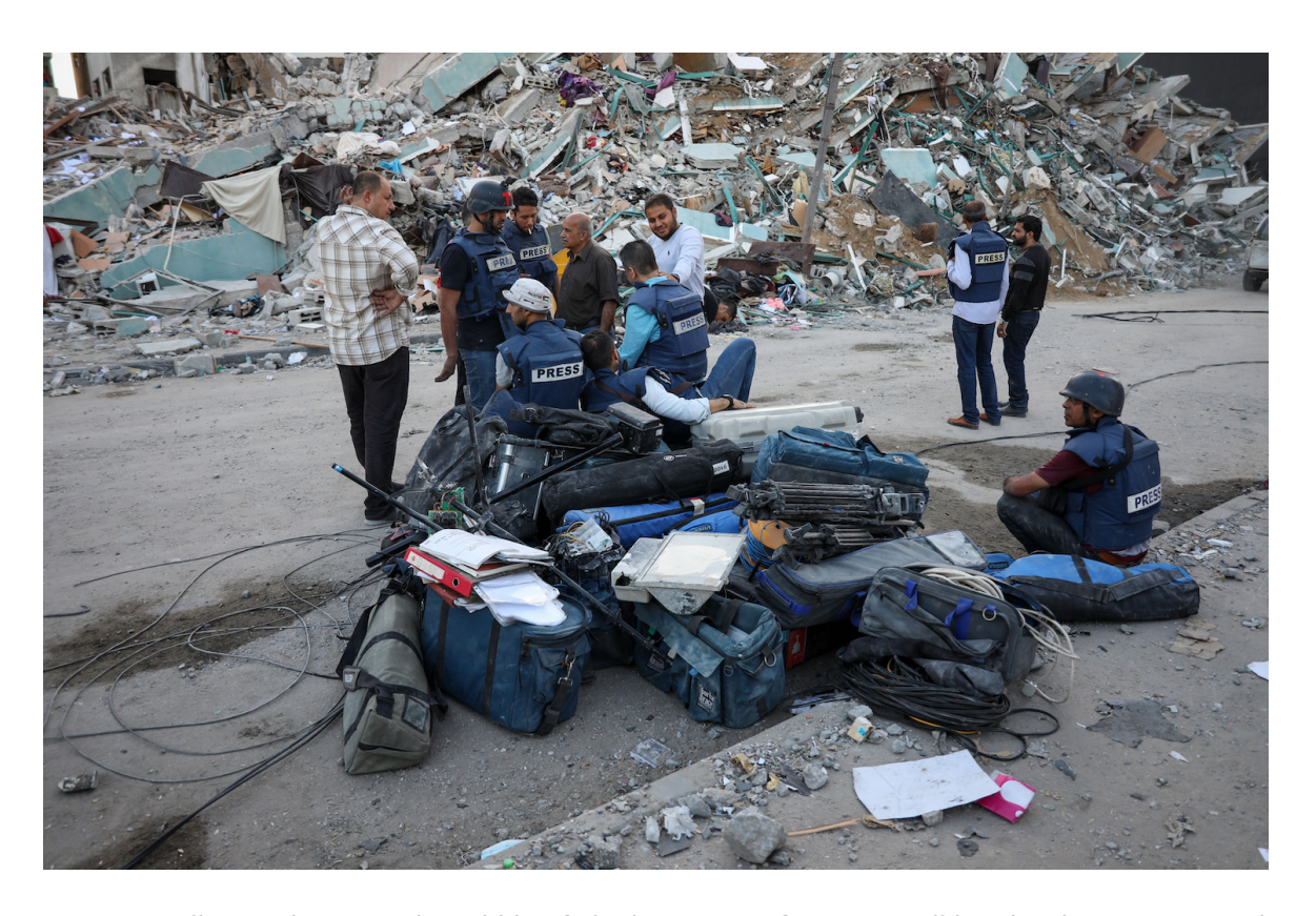
Journalists gather near the rubble of al-Jalaa Tower after an Israeli bombardment on Saturday.

In a statement, the Israeli army said it had struck the building becuase it housed "entities belonging to the military intelligence of the terrorist organization Hamas" without elaborating.