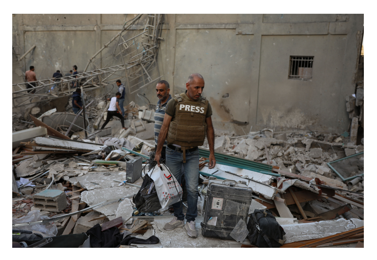
A media worker gathers what he can find of his belongings amid the rubble of al-Jalaa Tower in Gaza city, after it was destroyed in an Israeli air strike on 15 May 2021.

Middle East Eye has released a <u>statement</u> condemning Saturday's attack: