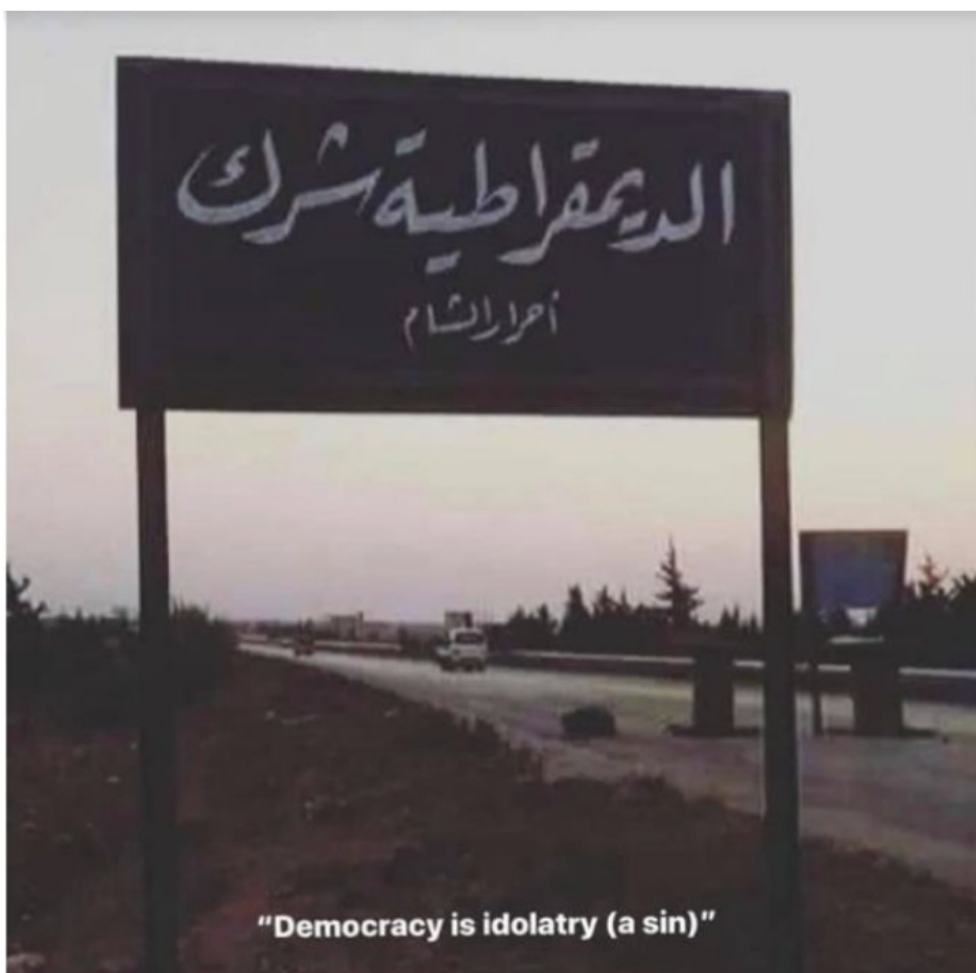
Idlib, Syria, 2020

Western-supported terrorist-controlled areas in Syria have always been anti-democratic. It is not a secret. It is openly proclaimed.