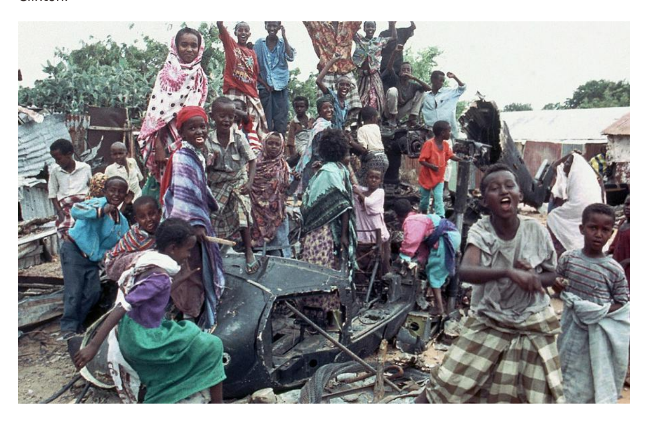
Somalians take down US helicopters chanting anti-American slogans during October 1993

The U.S. ordered massacres of leading Somalian political groupings prompting anger and hostility towards their troops. By October 1993, the number of casualties inflicted upon the Pentagon troops led to the eventual withdrawal by the administration of then President Bill Clinton.