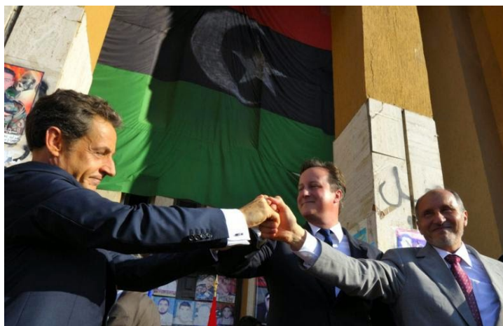
Image: France helped NATO successfully hand Libya over to Al Qaeda terrorists who – with NATO support – would use it as a springboard to attack Syria. The ultimate goal is to use Al Qaeda terrorists to overrun Iran, then southern Russia and western China.