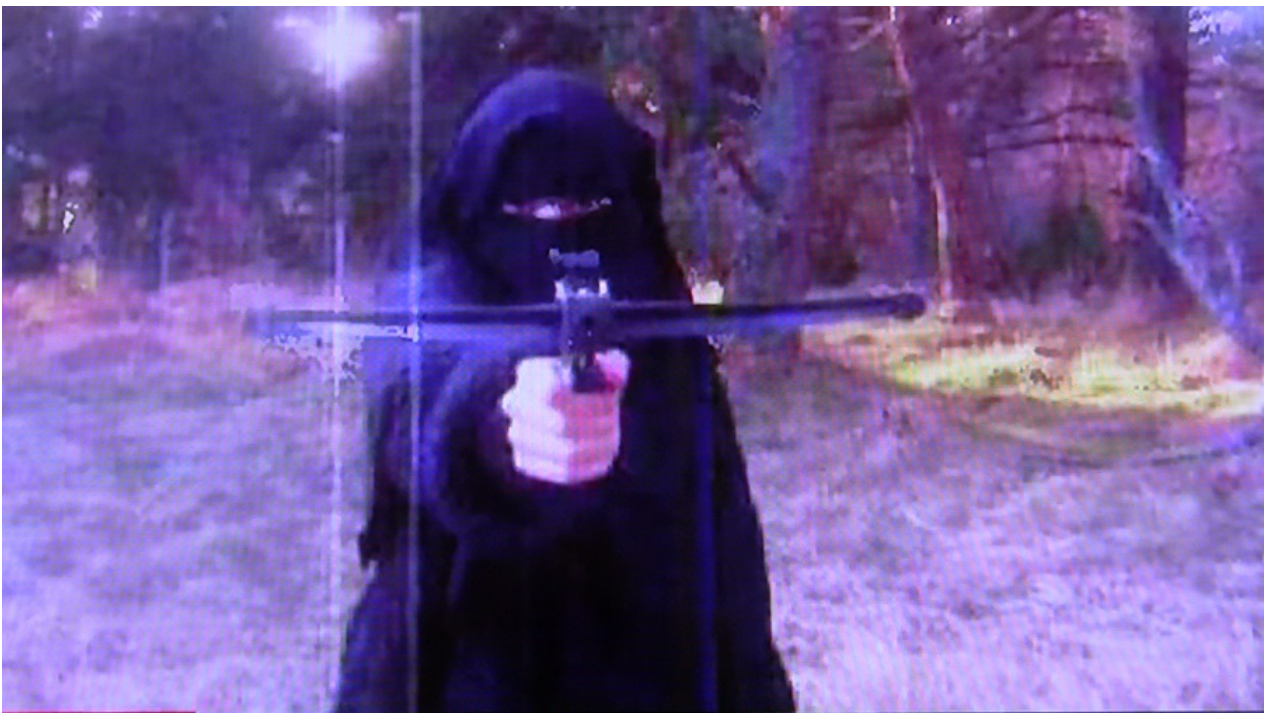
Terror Mascot: Staged photo which the media are portraying as Hayat Boumeddiene.

As the female in both photos is completely covered, it's impossible to determine whether or not it is in fact who French authorities are hinting it is, female fugitive suspect, Hayat Boumeddiene. Her profile, at least in terms of how she's being casted by the media so far, appears very similar to American Katherine Russell the female handler and 'wife' of Boston Bomber and FBI informant Tamerlan Tsarnaev.