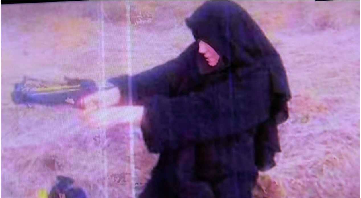
Female posing with gun.