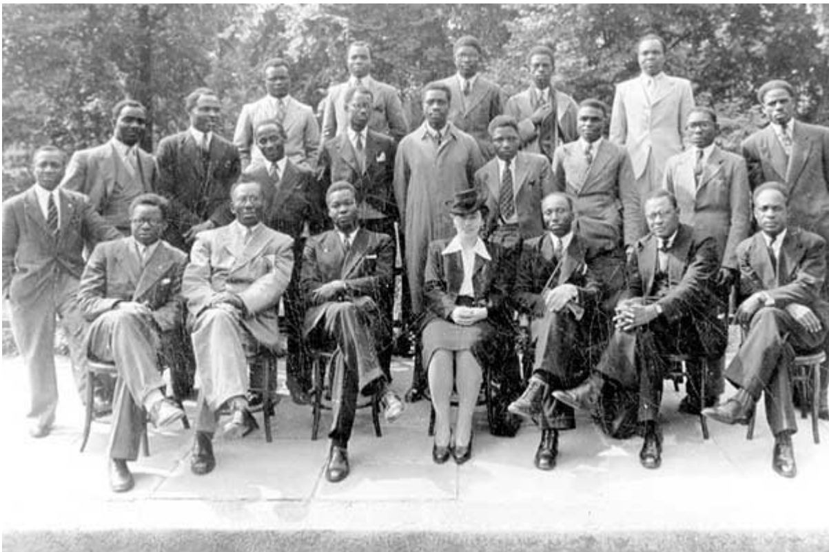
Pan-African Congress Fifth Congress delegates in Manchester, England in October 1945.

The Fifth Pan-African Congress was convened later in October 1945 in Manchester. This gathering was pioneering as a result of its mass character encompassing figures such as Kwame Nkrumah of the Gold Coast, George Padmore of Trinidad, Amy Ashwood Garvey of Trinidad and Dr. W.E.B. Du Bois of the United States. What made the summit so significant was the representation from African workers and farmers through their organizational formations.