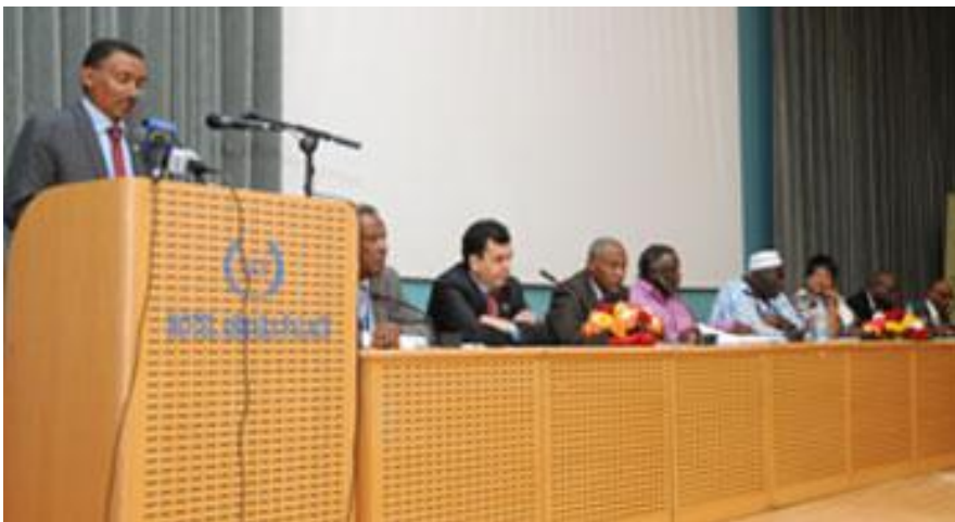
Organization of African Trade Union Unity conference held in Asmara, Eritrea.

The struggle for the acquisition of national independence would swiftly emerge after WWII. From the rebellions and general strikes in the Gold Coast from 1947-1950; the Egyptian Officers Coup of 1952; the ascendancy of Kwame Nkrumah and the Convention People's Party (CPP) in establishing a transitional government in the soon to be renamed Ghana from 1951-1957; Guinea-Conakry's independence vote of 1958; the Defiance Campaign Against Unjust Laws in South Africa between 1952-1956; Sudanese declaration of independence in 1956; Algeria's National Liberation Front (FLN) war of independence from 1954-1961; etc., Africa was clearly on the move.