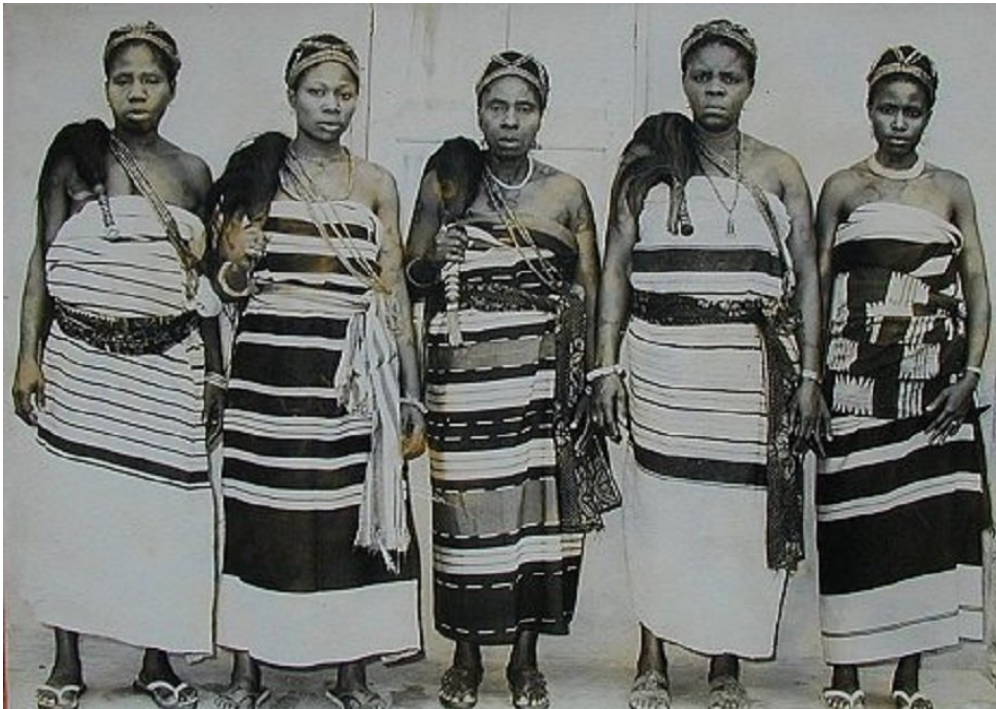
African Women’s War participants in Nigeria during 1929-1930.

Nigeria experienced the “Women’s War” of 1929-1930 when the threat of taxation and the restructuring of traditional life sparked a rebellion which lasted for several months in the eastern region of the country. Women torched colonial buildings and attacked British interests as well as warrant chiefs who had been collaborating with imperialism. The events represented the advent of a nationalist movement which transcended ethnic lines. (See this )