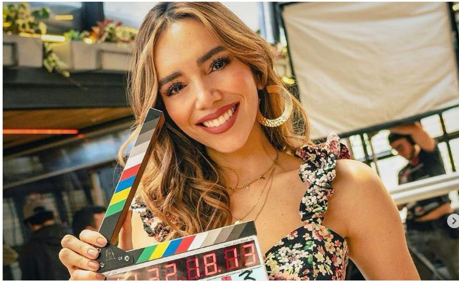
Alejandra Villafaña, actress who died of cancer.

Neither surgery nor chemotherapies worked to treat terminal cancer suffered by the 34-year-old actress