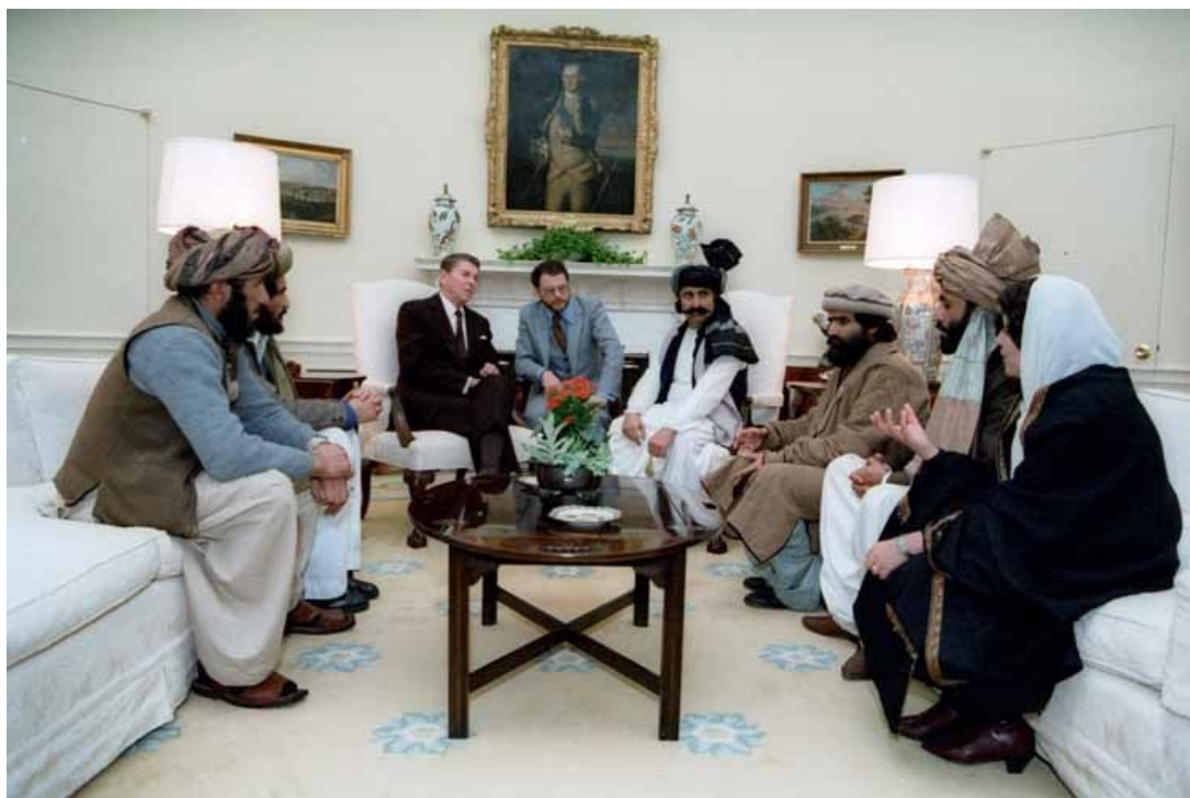
President Ronald Reagan meets leaders of the Mujahideen “Freedom Fighters” at the White House (1980s)

In March 1985, President Reagan signed National Security Decision Directive 166,...[which] authorize[d] stepped-up covert military aid to the mujahideen, and it made clear that the secret Afghan war had a new goal: to defeat Soviet troops in Afghanistan through covert action and encourage a Soviet withdrawal. The new covert U.S. assistance began with a dramatic increase in arms supplies — a steady rise to 65,000 tons annually by 1987, ... as well as a “ceaseless stream” of CIA and Pentagon specialists who traveled to the secret headquarters of Pakistan’s ISI on the main road near Rawalpindi, Pakistan. There the CIA specialists met with Pakistani intelligence officers to help plan operations for the Afghan rebels.[4]