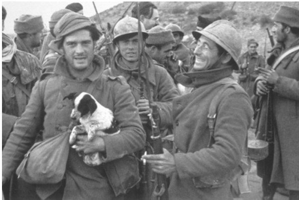
Orwell holding a puppy in Spain during the Spanish Civil War