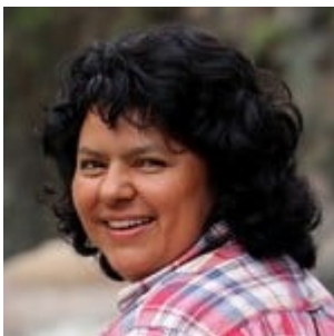
Activist Berta Caceres