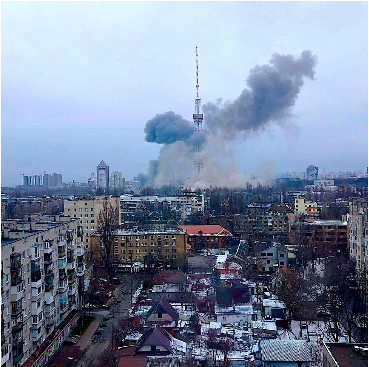
Russian bombardment of telecommunications antennas in Kiev, March 1.

Indeed, using a hypothetical Russian tactical nuclear attack on Ukraine as a working assumption, the Biden administration has developed a range of non-nuclear options in response, including — according to Newsweek — a “decapitation” strike targeting Russian leadership, to include President Vladimir Putin.