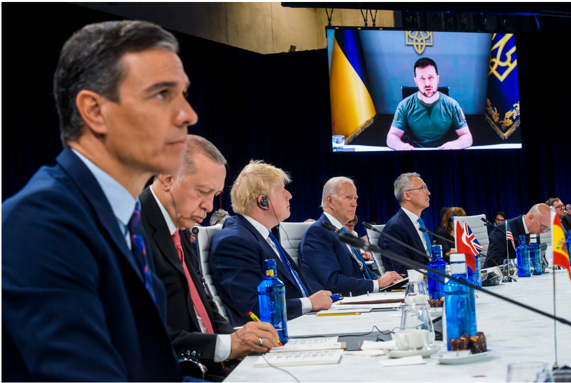
Ukraine's President Volodymyr Zelensky joins NATO meeting in Madrid in June via video link.

So far, neither side has directly challenged the red line of the other, although the United States has edged right up to it with the provision of tens of billions of dollars of advanced weaponry, financial assistance and intelligence and communication support for Ukraine.