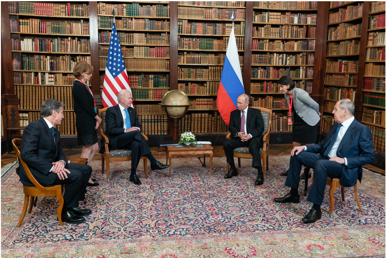
U.S. President Joe Biden and Russian President Vladimir Putin meeting at the at the Villa La Grange in Geneva, June 16, 2021, with U.S. Secretary of State Antony Blinken on left, Russian Foreign Minister Sergei Lavrov, right.

The reality, however, is that Russian nuclear doctrine does not allow for such a scenario. Indeed, there are only two conditions where Russian nuclear doctrine permits the employment of nuclear weapons.