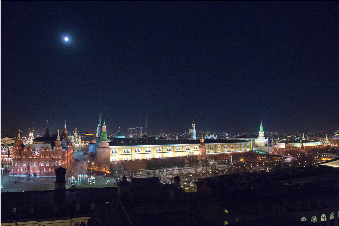
The Kremlin, March 2016.

From the perspective of both Ukraine and NATO, the Russian army is no longer viewed as invincible, but actually vulnerable. Both NATO and Ukraine appear ready to continue an aggressive military posture designed to attrite Russian forces while recapturing Ukrainian territory.