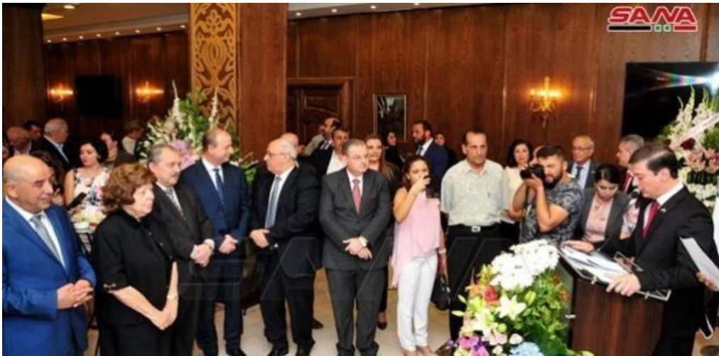
Venezuelan Independence Day is celebrated in Damascus. VP Dr. al Attar, second from left.

Among the dignitaries attending the important event was Dr. Najah al Attar, Syria's vice-president. Contrary to the frothing of the rabid hyenas at the UN — who plot to appoint their choices of women in political positions — Syria has an almost 10,000 year history of women in leadership roles.