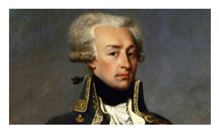
Marquis de Lafayette

For a long time already, the United States had enjoyed good relations with Germany. It was not Germany but Britain that was the traditional enemy and great rival of Uncle Sam. The British were former colonial masters against whom the country's war of independence had been fought during the 1770s, and against whom another armed conflict took place between 1812 and 1815, the so-called War of 1812; and throughout the 19th century relations with Britain had remained tense on account of issues such as the border of the US with British North America (to become the Dominion of Canada in 1867), influence and commerce in the Pacific, South America, and the Caribbean, and British sympathy for the South during the American Civil War. (Until the 1930s, in fact, Washington would have plans ready for a possible war against Britain.)