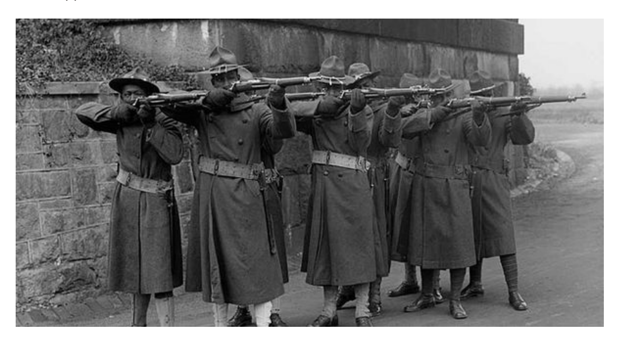
Black Americans served in the First World War

the Atlantic. The authorities were hoping for one million volunteers, but only 73,000 men responded to the call. Already on May 18, a law was therefore passed, the Selective Service (or Selective Draft) Act, which introduced a selective system of compulsory military service, the "draft", making it possible to recruit the required number of soldiers. But the draft faced much opposition, and more than 330,000 men were classified as draft evaders.