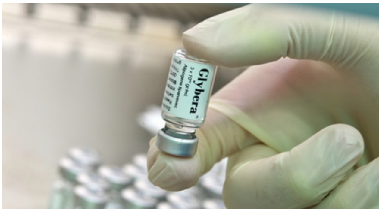
Image: Glybera – the first Western-approved gene therapy may treat a rare genetic disorder affecting the pancreas for an entire lifetime with a single treatment. One doesn't need to stretch their imagination far to imagine the consequences this will have on big-pharma profiteering, nor the measures they will take to protect their interests. Ultimately, such treatments belong in the people's hands – not special interests and the governments that serve them.