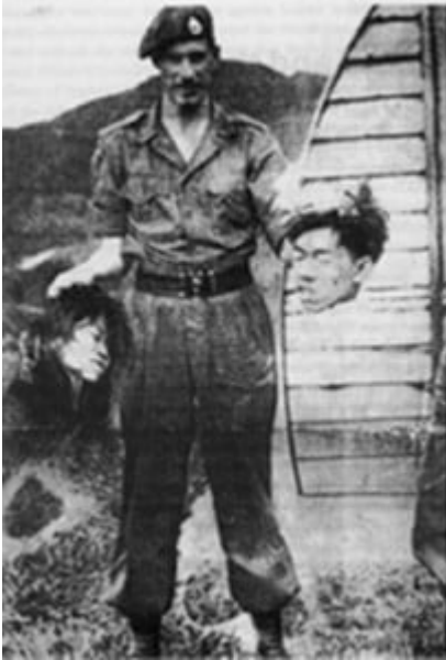
Image: A British Royal Marine in April 1952 grins proudly as he displays the severed heads of a young man and woman who may have or may not have exercised their legal right to resist foreign occupation.

The classy Brits would also, a la Game of Thrones , line the roads with rotting corpses of people they had slaughtered, as a terror-warning to anyone thinking about resisting the Empire. This is how the Brits were, as was often claimed in the West, establishing their global empire in a “fit of absent-mindedness.” Just absent-mindedly displaying slaughtered corpses and sewing people into animals like in Silence of the Lambs . Hm? What’s that? Sorry, I nodded off while I was doing my sewing. So absent-minded.