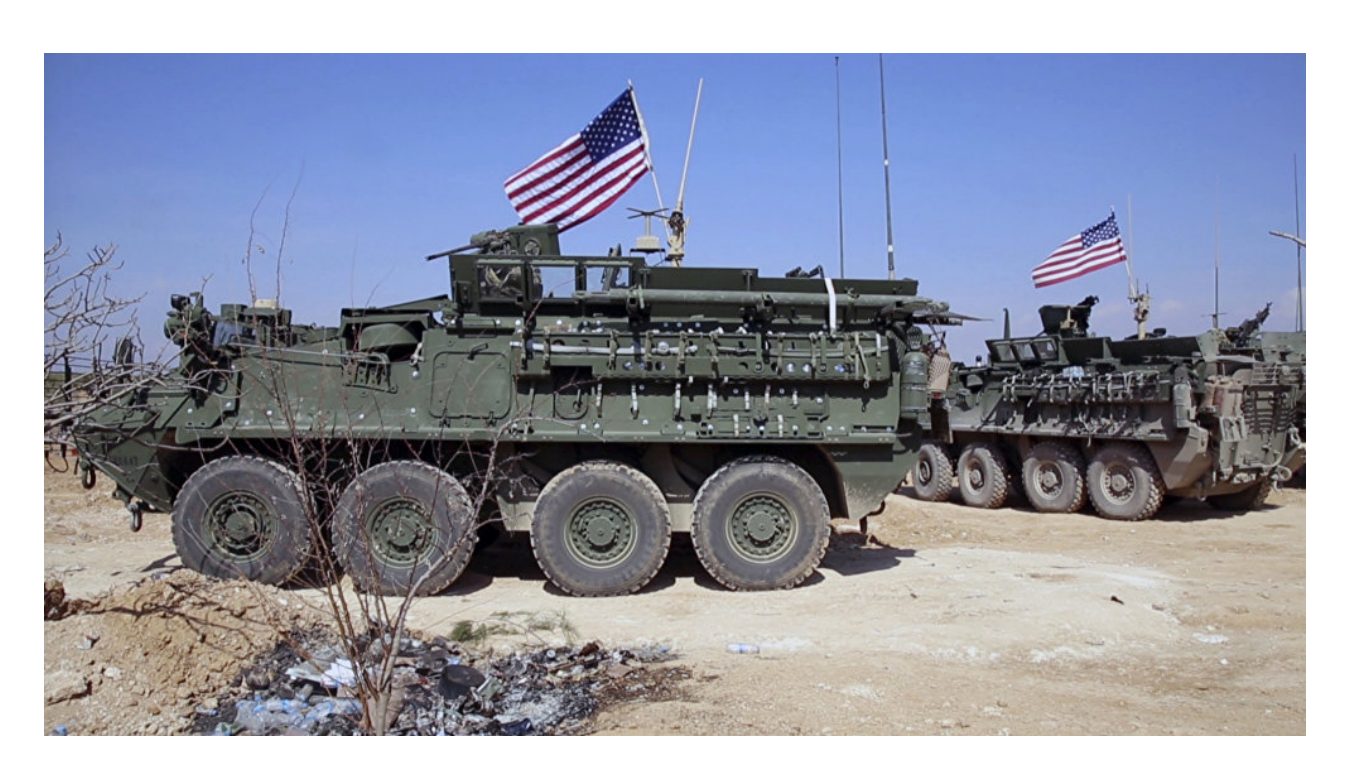
US forces in Manbij area, March 2018

"We are prepared to stay here, as the president (Donald Trump) has made clear ... We are prepared to stay here [in Syria] to ensure the enduring defeat of the Islamic State of Iraq and the Levant [ISIL],"