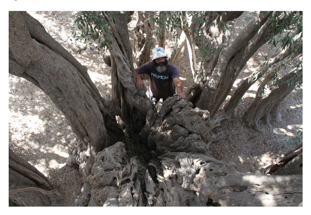
In the first six months of 2019, the UN recorded the uprooting, burning or vandalising of more than 4,100 trees by Israeli settlers

The trees face a double threat to their existence, with the Israeli army systematically <u>cutting</u> <u>down trees</u> and Jewish settlers regularly carrying out acts of violence, including vandalism, against Palestinian towns and fields.