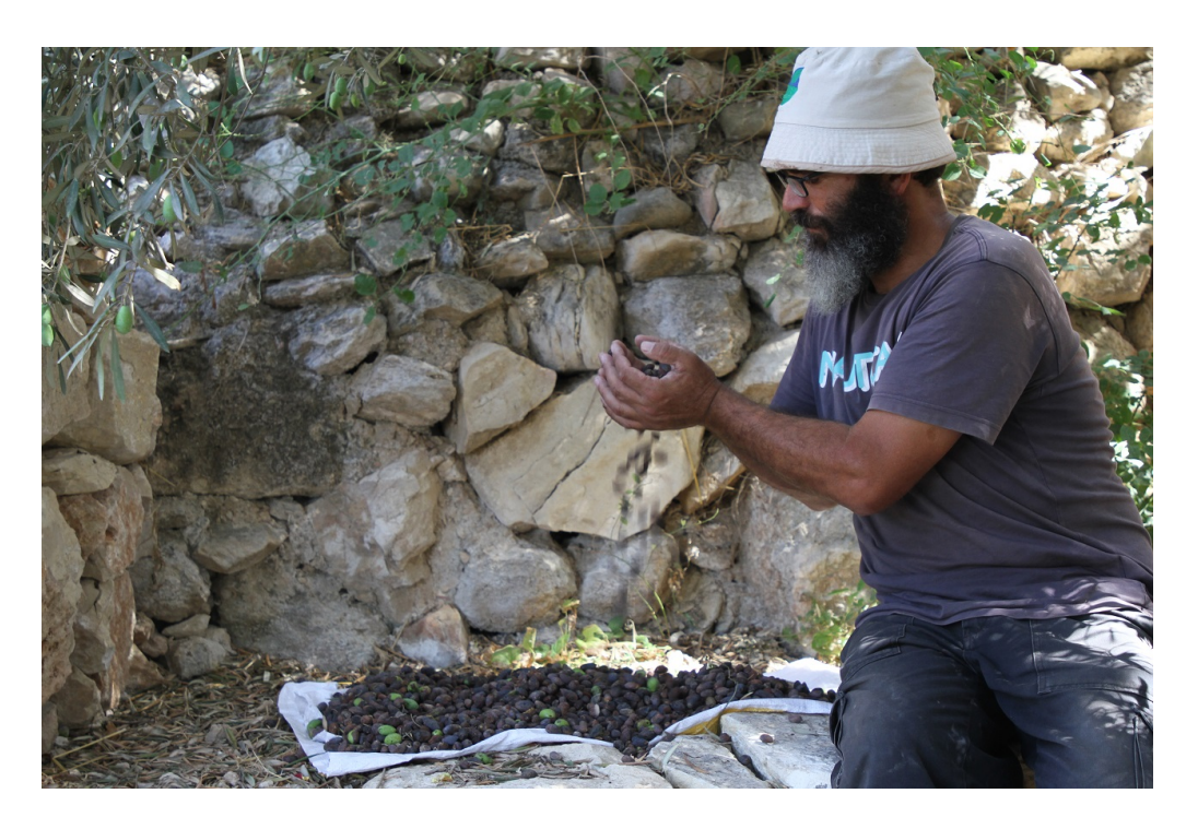
The tree used to produce half a tonne of olives each year, out of which 600 kilograms of olive oil could be made