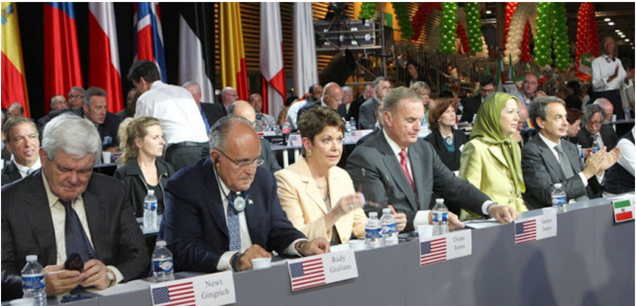
Image: Shoulder-to-shoulder, literally, with Saudi state sponsors of terrorism, America's "right" attend a rally in support of armed terrorist front, Mujahedeen-e-Khalq (MEK) which kidnapped and killed US military officers, US civilian contractors, and hundreds of Iranian civilians. Many of these characters are regularly interviewed and their views promoted by Breitbart.