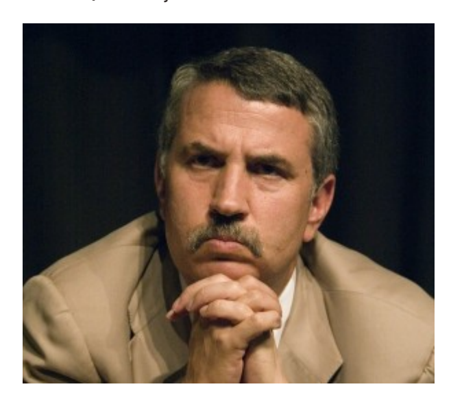
New York Times columnist Thomas L. Friedman.

This more complex reality is completely missing in the new round of political/press hysteria in the United States. The neocons and their liberal-hawk sidekicks only talk about stopping the "barbarism" of the Syrian government and its Russian allies as they try to finally wipe out Al Qaeda's jihadists and their "moderate" allies holed up in eastern Aleppo.