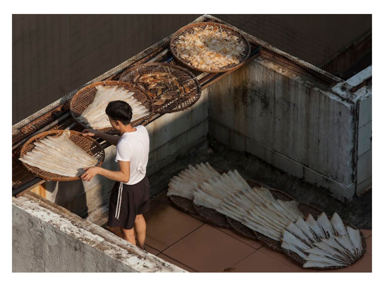
Demand for shark fins in traditional cuisines throughout Asia has soared in recent decades.