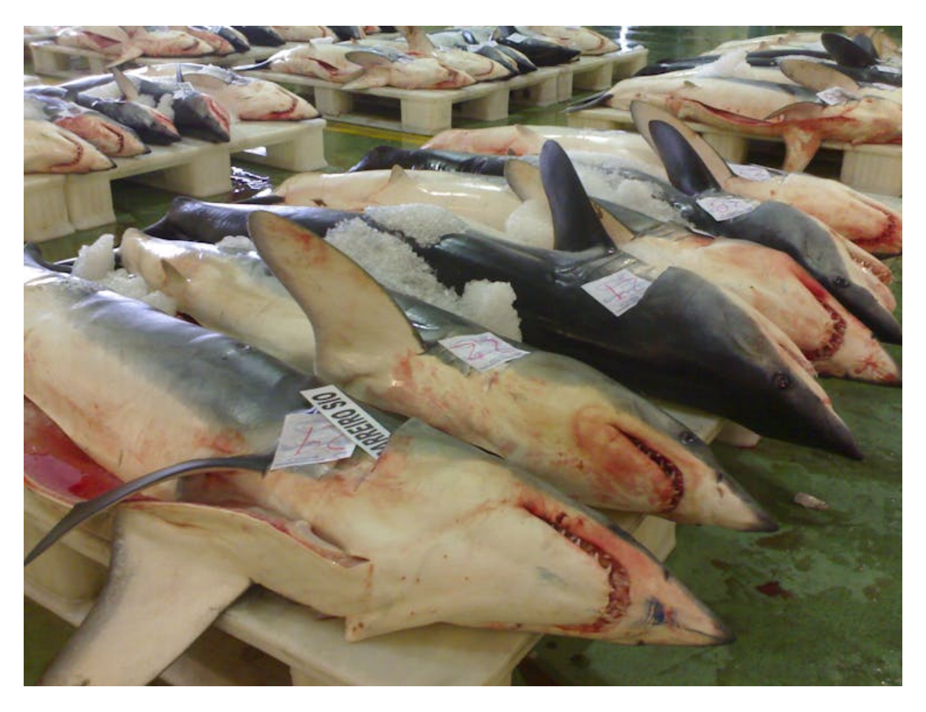
Shortfin mako sharks are one of the world's fastest animals, but often fall foul of fishing gear.

The study also found increases in the proportion of sharks that are being fished beyond sustainable levels. But it's particularly worrying that unreported catches weren't included in the study's analyses. This means the number of sharks and rays killed by fishing boats is likely to be an underestimate and the actual declines of these species may be even worse. Unlike most species of bony fish, sharks and rays produce few offspring and grow slowly. The rate at which they reproduce is clearly no match for current levels of industrialised fishing.