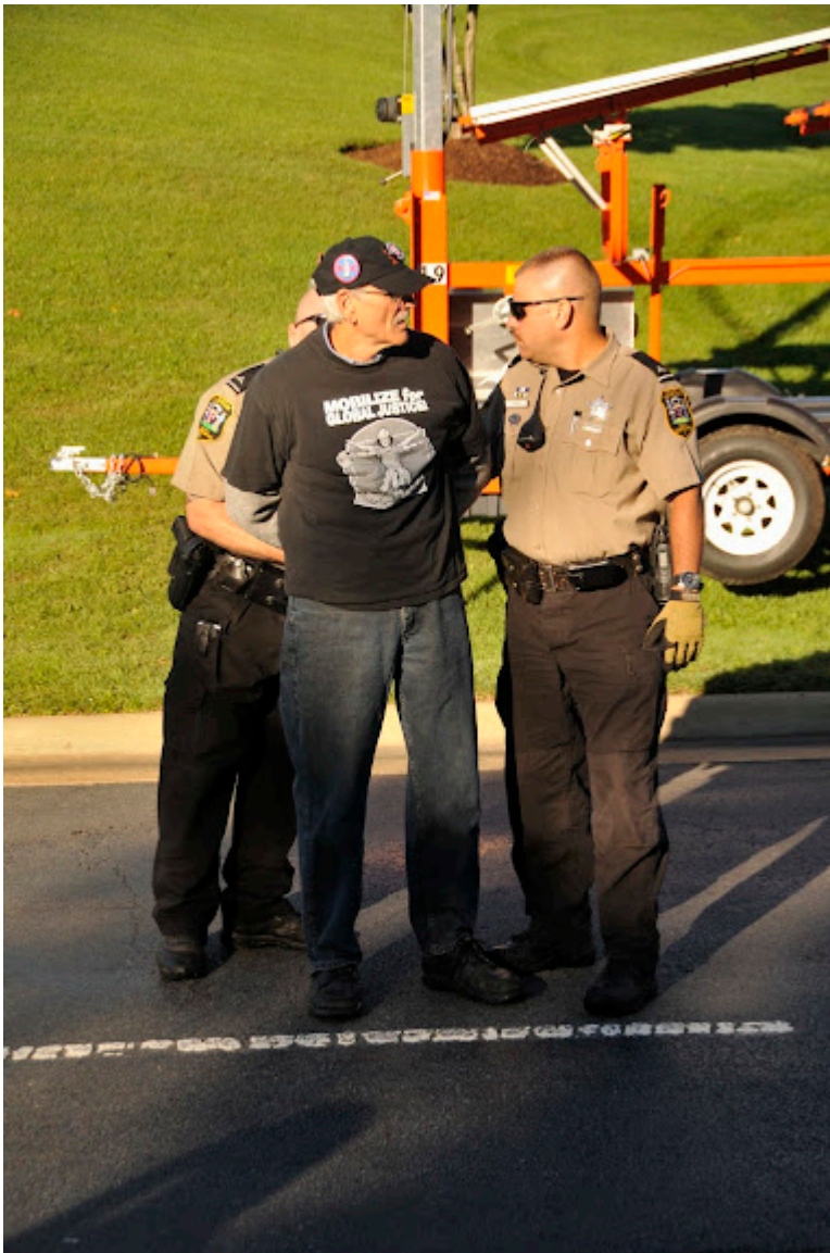
Dick is taken into custody