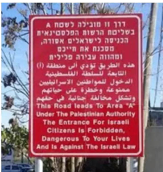
Image on the right: Sign entering Area A, Israeli Citizens Forbidden.

Palestine has hyper-segregation: Palestine can only be described as a modern apartheid state with updated Jim Crow laws. We drove on Jewish-only roads where the color of a person's license plate determines if they can use the road. There are military checkpoints along these roads. Palestinians are often forced to take long detours to get around the