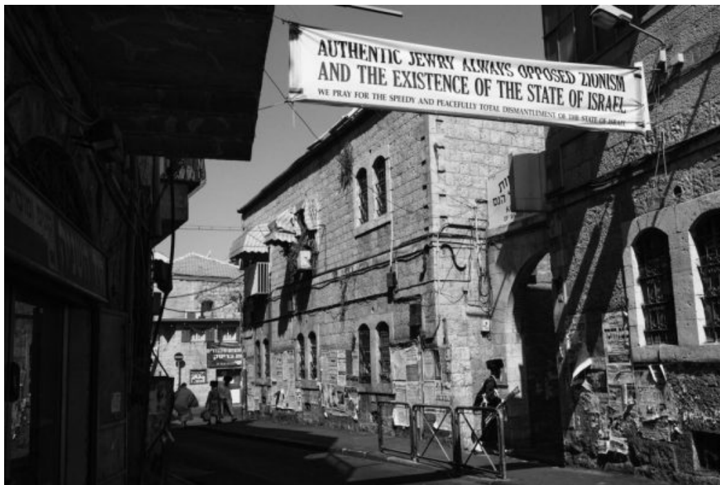
A banner hanging in Mea Shearim, a Jewish neighborhood in Jerusalem.

In the West Bank, Jerusalem, and Gaza, this land annexation has made a two-state solution physically impossible. The combination of hundreds of thousands of settlers, Jewish-only roads plus the Expansion (or Annexation) Wall that divides Palestinian communities, and more than 200 checkpoints have severely restricted movement for Palestinians and seized 78% of their country.