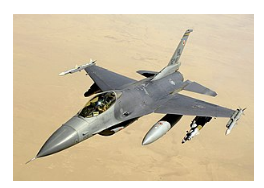
F-16 Fighting Falcon

The airstrikes have been casually described by the media as part of a "soft" counterterrorism operation, rather than an act of all out war directed against Syria and Iraq.