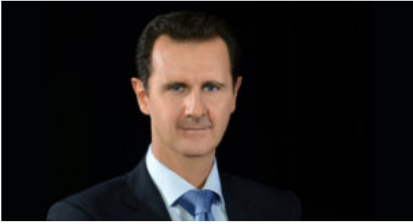
Syrian President Bashar al-Assad.