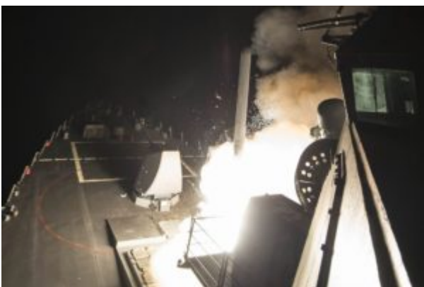
The Arleigh Burke-class guided-missile destroyer USS Ross fires a tomahawk land attack missile from the Mediterranean Sea, April 7, 2017.

The Times report extrapolated from that video where the bombs would have struck and then accepted that a fourth bomb – not seen in the video – delivered a sarin canister that struck a road and released sarin gas that blew westward into a heavily populated area supposedly killing dozens.