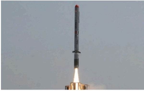
'Nirbhay' sub-sonic cruise missile launched from Chandipur, Odisha, India on 17 October 2014

The US-led initiative for the NSG (including Australia) to engage in nuclear commerce with India has the additional effect of opening the opportunity to loosen NPT and IAEA safeguards for other states, and possibly NPT members. As a uranium supplier, Australia's consent to allow reprocessing until now has been limited to the EU (UK and France) and Japan, stated to be for the purposes of reprocessing spent fuel into plutonium and MOX fuel for use in nuclear reactors for electricity generation. Even though Japan is an NPT signatory, however, high-level officials both prior to and after 3.11 have publicly entertained the notion of Japan's nuclear armament. Former Defence Minister Morimoto Satoshi and LDP Secretary General Ishiba Shigeru have both re-asserted that Japan's commercial nuclear program, plutonium stockpiles and nuclear plant re-starts could be regarded as a 'tacit nuclear deterrent' in the eyes of other nations. 66 Further, in October 2012, Japan's Foreign Ministry refused to sign a UN initiative mounted by 16 member states to outlaw nuclear weapons worldwide as it stated that it would not be compatible with the Japan-US security alliance. In January 2014, Foreign Minister Kishida Fumio, though he stopped short of stating that Japan would endorse the use of nuclear weapons, reiterated that the potential use of nuclear weapons should be limited to extreme circumstances defined by the right to individual and collective self-defence. 67