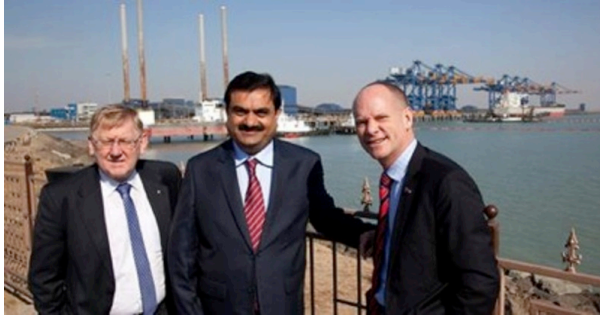
Australian Minister for Resources and Energy Martin Ferguson, Adani group founder Gautam Adani, Queensland Premier Campbell Newman in India in 2012.

plans are halted, ships will depart from these ports and pass through a newly dredged channel through the world heritage-listed Great Barrier Reef. Alternatively, the material could be freighted by road to Darwin or Adelaide ports (which hold uranium licenses). 44 Environmentalists in both India (Conservation Action Trust) and Australia (Greenpeace/Environmental Justice Australia) mounted a campaign against the Carmichael mine arguing that it threatens the health and livelihood of poor rural people in India while not delivering the benefits promised, and is contrary to the principles of ecologically sustainable development. 45