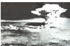
The Legacy of Hiroshima and Nagasaki

As Bush prepares public opinion for the invasion of Iraq, the overthrow and/or assassination of Saddam Hussein, and the possible use of nuclear weapons, General Pervez Musharaf is rattling the nuclear saber against India. Once again, the rational fear and anger of a mobilized public may be the only truly effective force against the mass-murder psychopathology of nuclear weapons. In his memoirs, Nixon claimed that the only reason he refrained from using nuclear weapons in autumn 1969 to "end" the Viet Nam war was the October 15 Mobilization which brought hundreds of thousands of protesters to the nation's capital: "On October 14, I knew for sure that my (nuclear) ultimatum failed."9