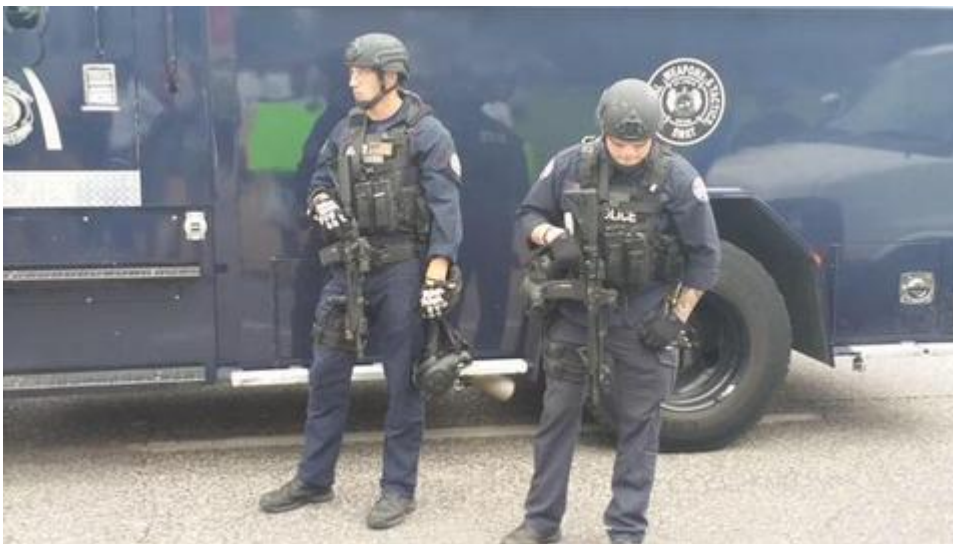
Swat officers on the scene of the shooting

As of yet, no witnesses to the shooting have come forward to contest the police version of events, which should nevertheless be given no credence whatsoever.