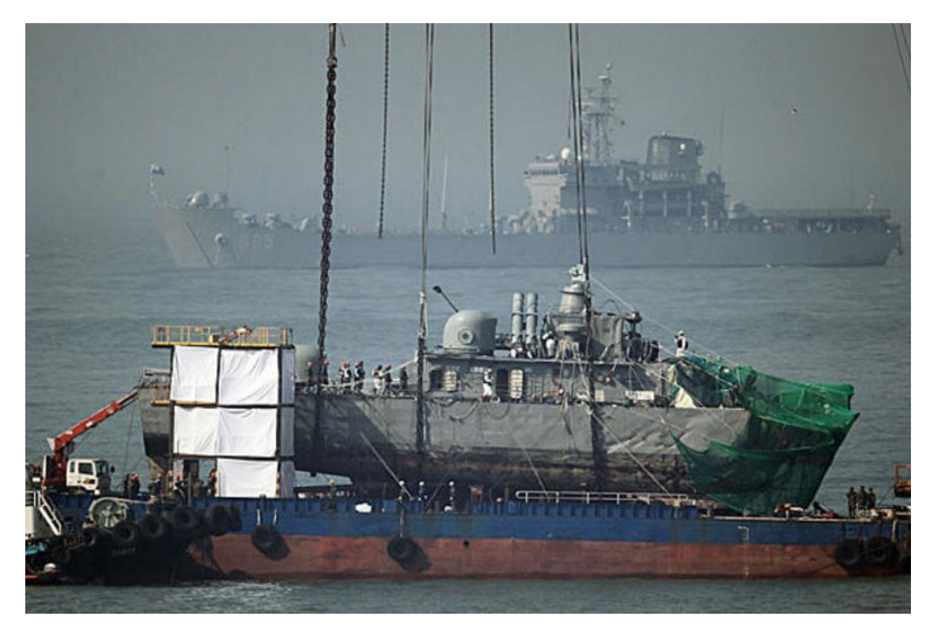
The stern of the Cheonan docked on a barge off Baengnyeong Island on 7 May, 2010.

However, it remains an enigma as to who fired or set off a torpedo or underwater mine. The South Korean right, claiming that a North Korean semi-submersible ship fired a torpedo, demands that the South Korean government launch a revenge attack on the North. The left and pacifists in the South suggest that the warship may have touched off an underwater mine installed in the 1970s by the South Korean military to prevent North Korean infiltration and still left there.