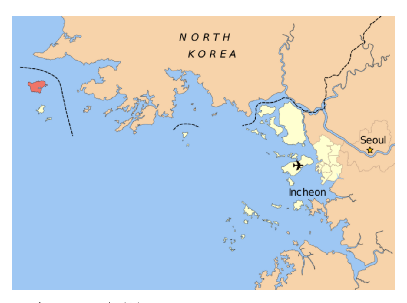
Map of Baengnyeong Island (1)