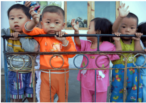
North Korean kids (image left)

Why would North Korea, or any nation for that matter - not have the same right as the US, UK, Russia, China, France, Israel, India, Pakistan, and the NATO member nuclear weapons sharing states of Belgium, Germany, Italy, Netherlands and Turkey - all of which have allegedly acquired B61 tactical nuclear weapons (Made in America) targeted at Russia, Iran and other countries in the Middle East allegedly for "defense purposes"?