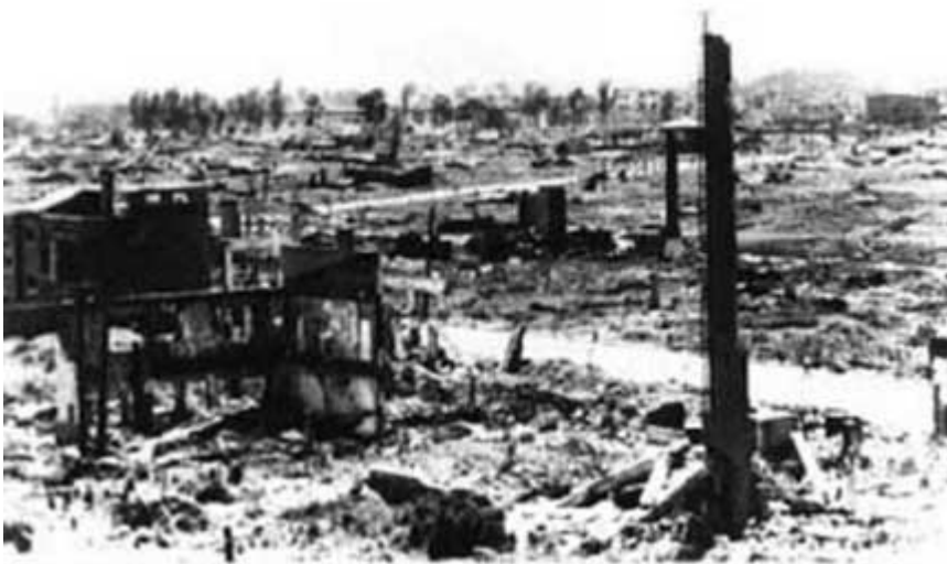
Pyongyang in rubble (1953)

In the words of Stephen Lendman, Trump wants to ignite Korean War 2.0 , which inevitably would lead to military escalation beyond the Korean peninsula.