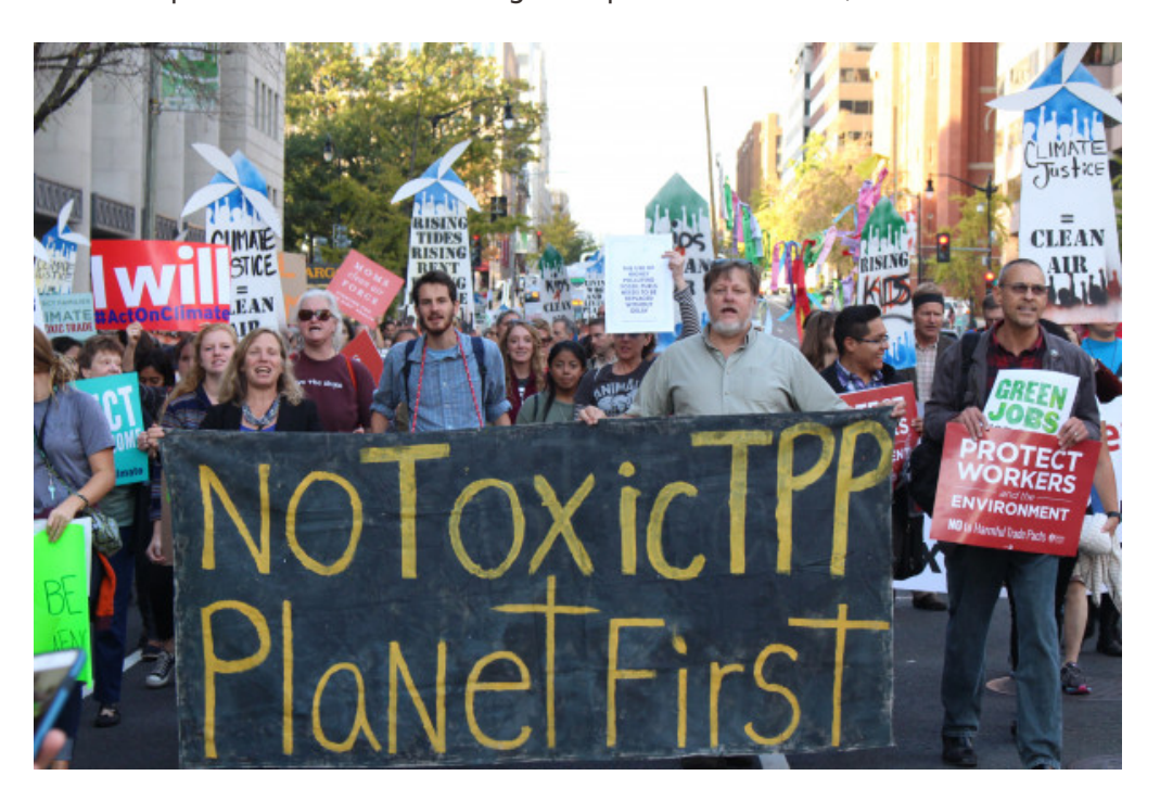
Trade for People and the Planet

Trade must benefit the working class everywhere while combating every form of discrimination and economic inequality. When the global economy works for everyone and makes reparations for the damages of past trade deals, then we will have "Fair Trade."