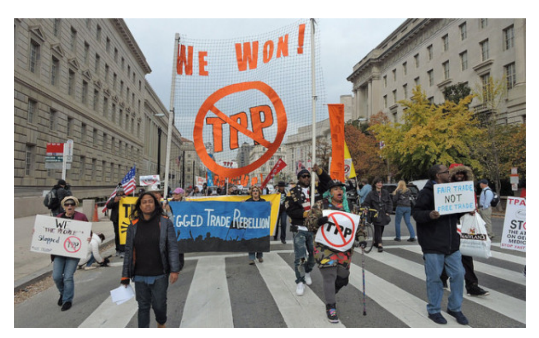
Our Strategy for Action

To achieve fair trade, negotiation must not be in secret but must be transparent. It must not be limited to transnational corporate interests but be led by broad civil society organizations, family farmers and small businesses to participate. There must be democratic checks and balances as the negotiation proceeds, accompanied by public hearings and legislative oversight. Ending corporate trade will not occur by tinkering, but through the transformation of the process and goals of trade deals.