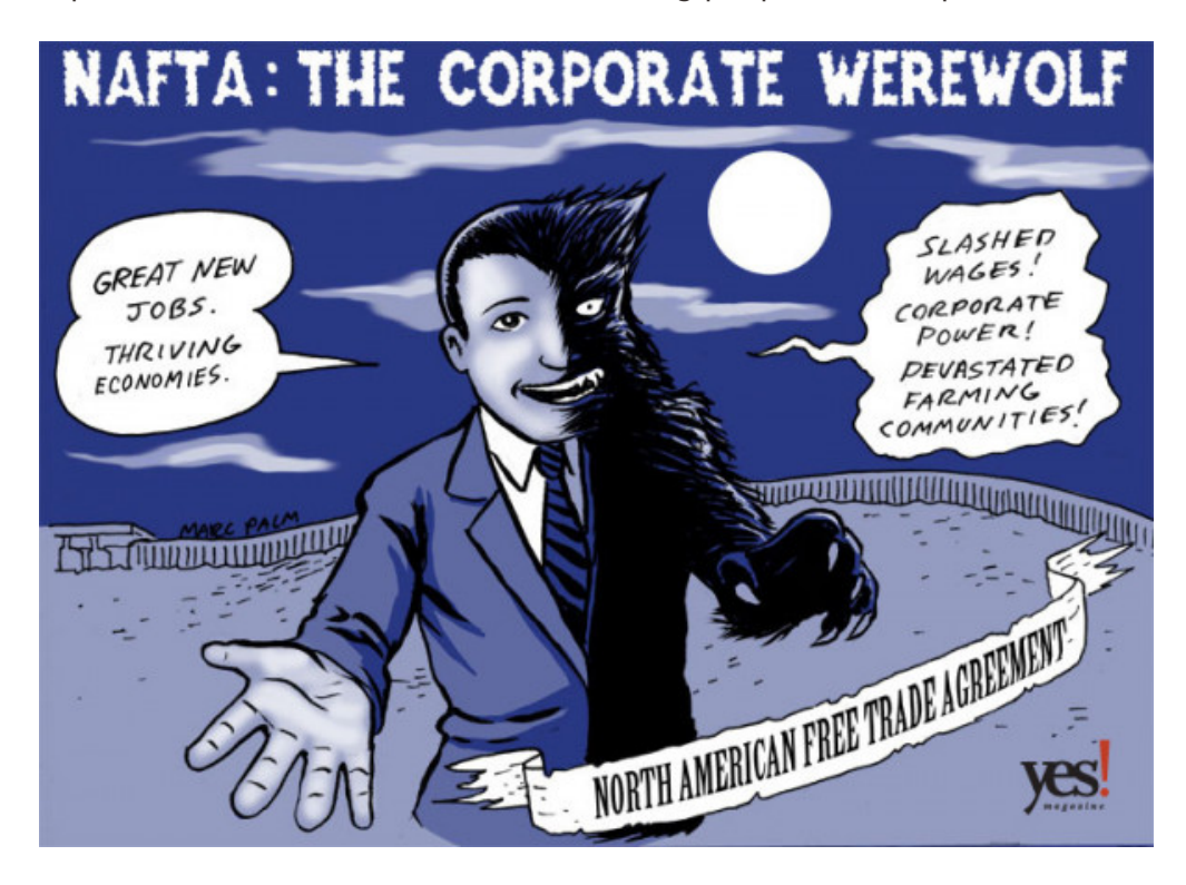
NAFTA 2 is a Trade Deal that Serves Powerful Corporations

NAFTA is a deal that lets corporations pit North American communities against one another to attain the lowest price and the highest profit and that will not change under the Trump administration. There is no tweak or modernization that can change this fact. No deal that seeks to employ and benefit the white working class while jeopardizing the very livelihood of black and brown folks in the United States, Mexico, and Canada should be deemed acceptable to anyone and must be made politically toxic to pass. The trade justice movement must be committed to changing the corporate trade model that NAFTA represents with trade that benefits working people and the planet.