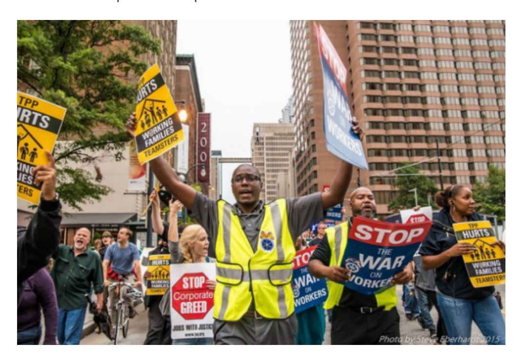
Pitting Community Against Community

This week, we explain our opposition to NAFTA2 and put forward a strategy to remake trade so it is no longer corporate-driven trade for the profits of a few, but people-driven trade to benefit all and protect the planet. See the list of actions below.