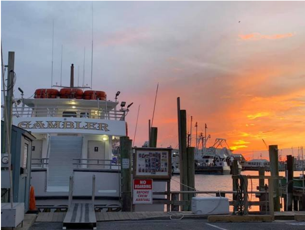
The Gambler fishing boat, Point Pleasant Beach, New Jersey.