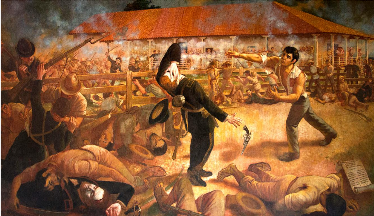
“La Pedrada” (The Stone), depicting the downfall of William Walker at San Jacinto.

Beginning in 1909, US Marines invaded and occupied Nicaragua. They dominated the country for the next three decades. The US occupation led to armed resistance organized by Augusto Cesar Sandino.