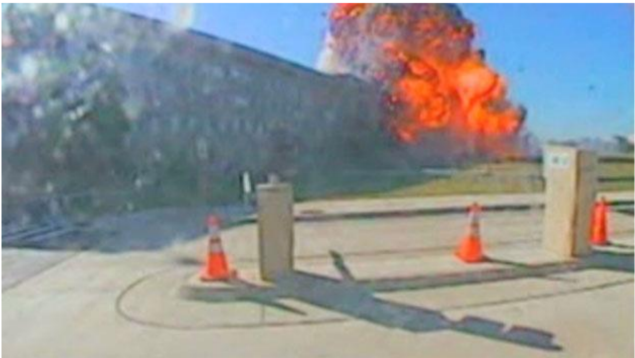
Fire from crashing of American Airlines Flight 77 into the Pentagon at 9:37 a.m. on September 11, 2001.

But why hadn’t Bush ordered the hijacked planes to be shot down an hour earlier, when he was first informed about the World Trade Center attacks and lives could have been spared?