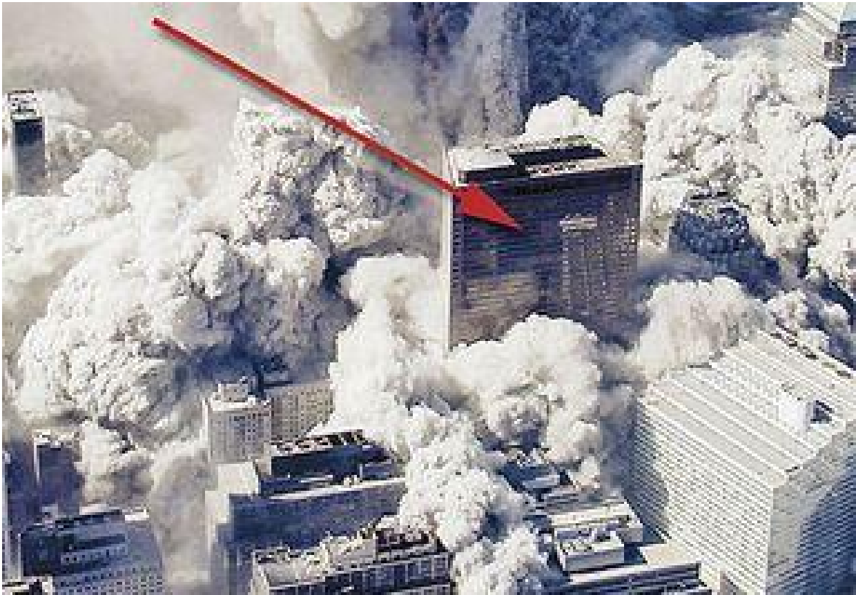
World Trade Center Building 7 stands amid the rubble of the recently collapsed Twin Towers.

modeling study on the collapse of World Trade Center Building 7 which concluded that “fire did not cause the collapse of WTC 7 on 9/11.” The collapse, rather, was caused by “near simultaneous failure of every column in the building,” which could be achieved only by a controlled demolition.