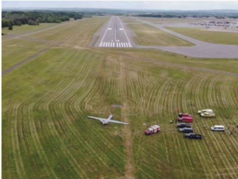
An MQ-9 Reaper drone operated by the NY Air National Guard's 174th Attack Wing is shown after crashing June 25, 2020 at Syracuse Hancock International Airport.

Updated: Apr. 18, 2021, 7:30 a.m. | Published: Apr. 18, 2021, 7:30 a.m.