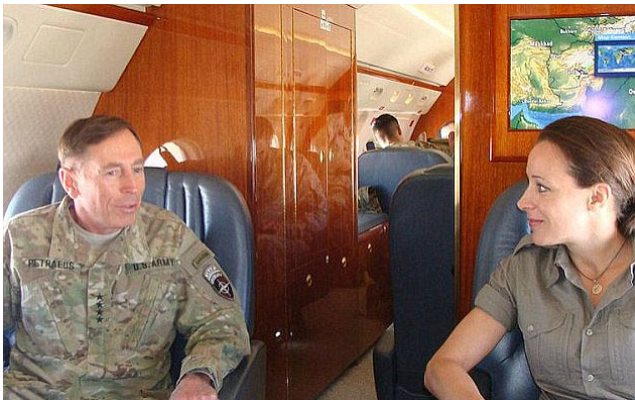
Hand in the honey pot: Petraeus and Broadwell.