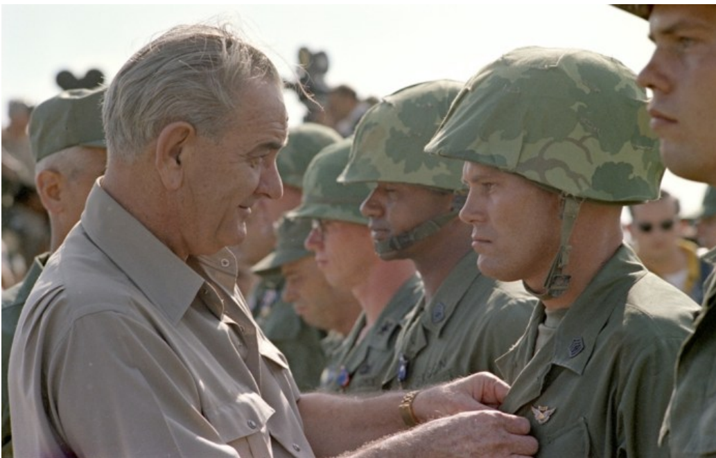
LBJ pins medal on U.S. soldier at Cam Ranh Bay, South Vietnam, in 1967.

LBJ also started increasing the U.S. intervention in Vietnam on November 29, 1963, well before the fake “Gulf of Tonkin incident” led to the Johnson administration fully engaging in what would be a losing war with North Vietnam. [23] American involvement in Vietnam would lead to at least 60,000 American deaths and countless more injuries, as well as a reported two million Vietnamese deaths. [24]