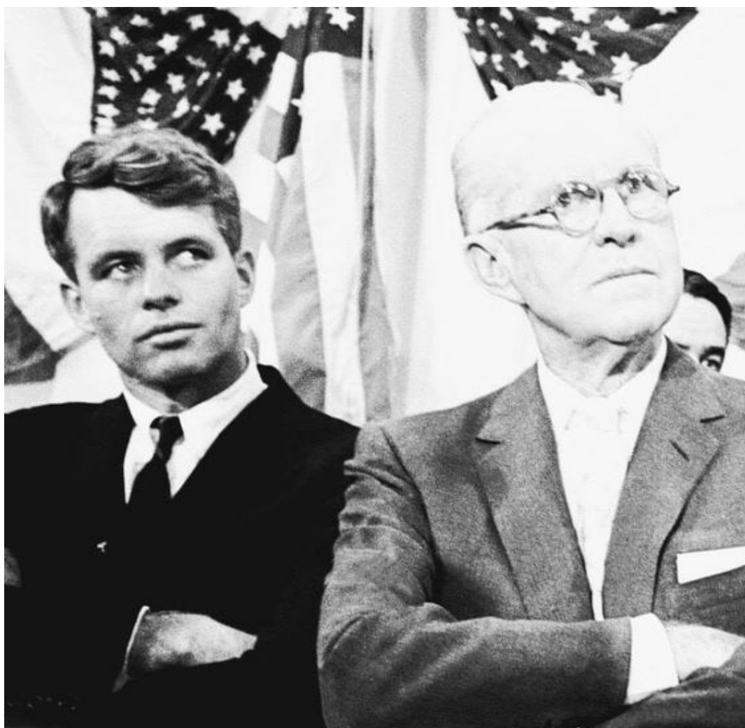
Robert Kennedy and Joseph Kennedy, Sr., listen to John's presidential victory speech in November 1960.

Stone then shows Robert Kennedy, Jr., speaking about his father's reaction: "My father's first call [after the assassination] was to the CIA desk officer, asking 'Did your people conduct this horror?!'"