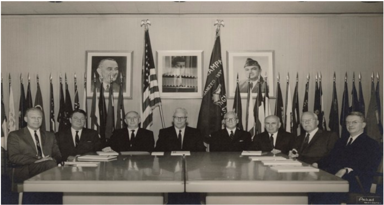
The Warren Commission. Pictured are members Gerald Ford, Hale Boggs, Richard Russell, Jr., Earl Warren, John Sherman Cooper, John J. McCloy, Allen Welsh Dulles and General Counsel J. Lee Rankin.

Two days after President Kennedy's assassination and Lee Harvey Oswald's arrest, Jack Ruby approached Oswald as he was being escorted in front of police and journalists in the police station garage, and fatally shot him.