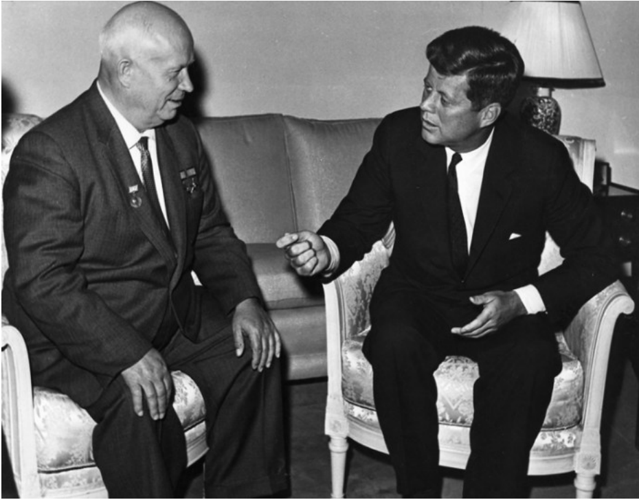
JFK and Soviet Premier Nikita Khrushchev in 1961.

President Kennedy's final blow against the war-mongering oligarchs came when he decided against sending American ground troops into Vietnam, and ordered an eventual complete pull-out of American involvement there.