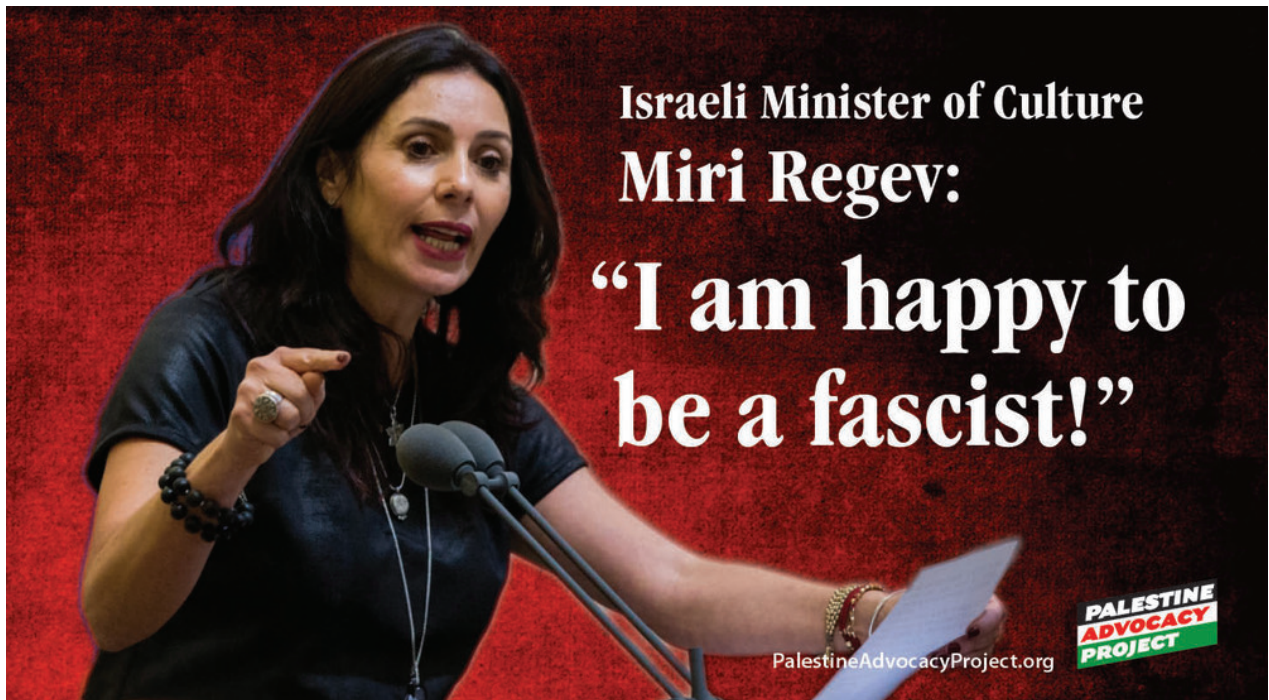
Image: Miri Regev, Israeli Minister of Culture and Sport: “I am happy to be a fascist”

and asks “How are these politicians that are so quick to accuse people of being anti-Israel or anti-Semitic the same ones using fascist language to describe an entire group of people?”