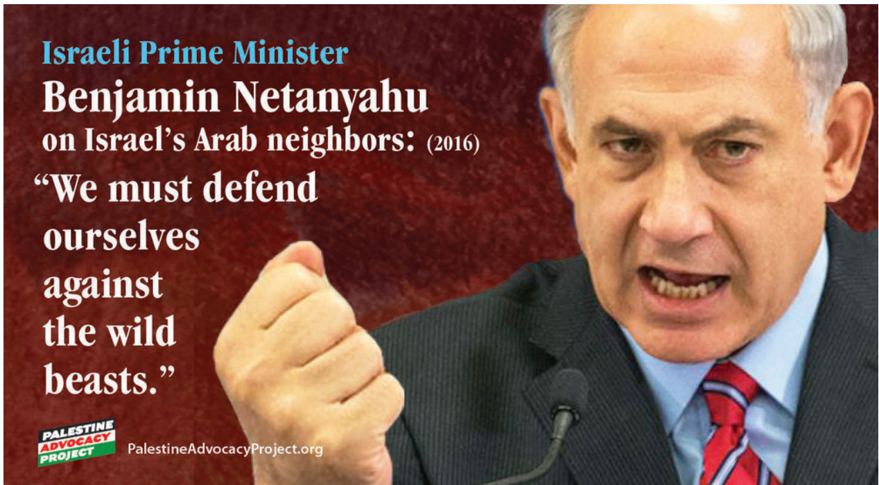
Image: Israeli Prime Minister Benjamin Netanyahu: "We must defend ourselves against wild beasts" (Graphic: Palestine Advocacy Project)

Palestine Advocacy Project notes that during this election cycle American politicians have condemned Donald Trump's racist, inflammatory rhetoric but they let Israeli politicians off the hook time and again because both the Democratic and Republican establishments pander to the Israel lobby: