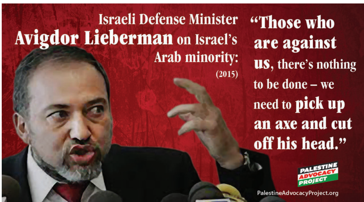
Image: Israeli Defense Minister Avigdor Lieberman "Those who are against us, there's nothing to be done – we need to pick up an ax and cut off his head"

The In Their Own Words series was created to spark conversation on U.S. college campuses seldom featured in the mainstream media. Thus far nine college campuses, including University of California-Berkeley, have agreed to publish ads in their campus newspapers.