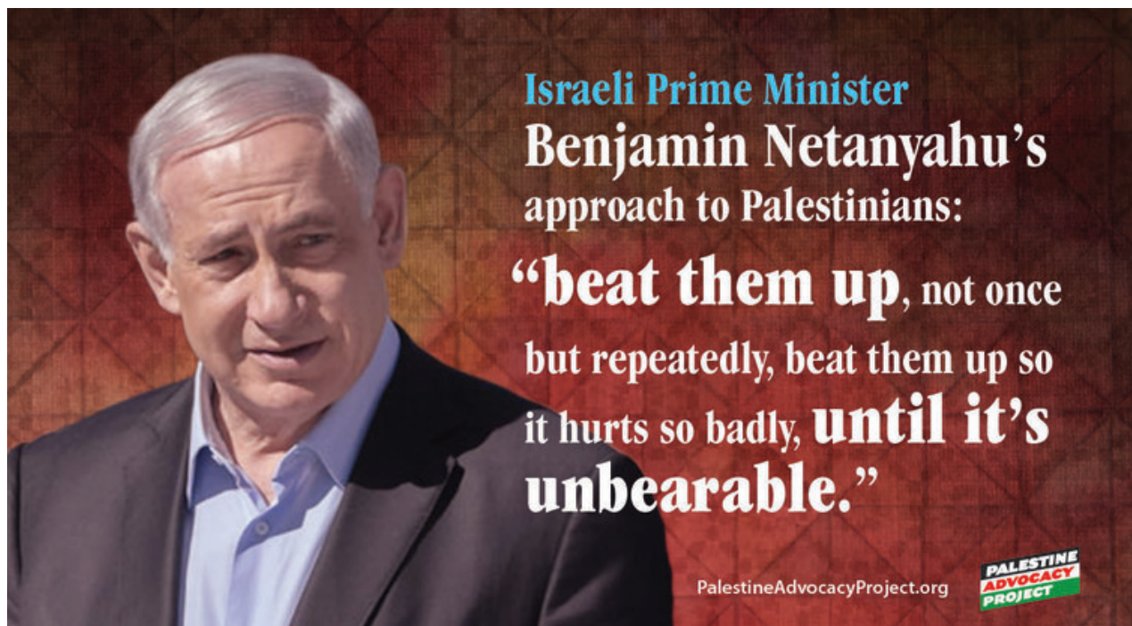
Image: Israeli Prime Minister Benjamin Netanyahu “beat them up, not once but repeatedly, beat them up so it hurts so badly, until it’s unbearable” (Graphic: Palestine Advocacy Project)

Check out more of these violent statements here . The campaign is also accepting donations here.