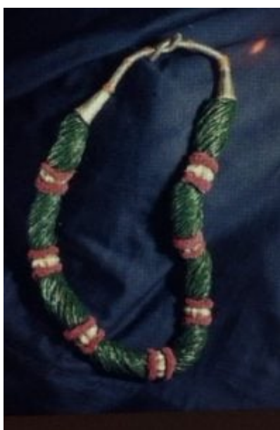
My Limbu naugiri

A Limbu naugiri embodies a whole set of sentiments which I cannot possibly untangle, identify and comprehend. It’s not a dowry. It does not in itself mark one’s marital status. My naugiri it does not reflect a personal indulgence in ornamentation. I myself wear no bangles, bracelets or earrings. (My neighbors had already noted this, with some dismay.) Nevertheless these Limbu companions really want me to take this piece of jewelry with me when I depart. Curio or art, it is a gift to me wrapped in their memories. It symbolizes our bond and the cooperative spirit of our months together.