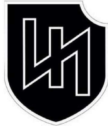
Emblem of the SS Division Das Reich.