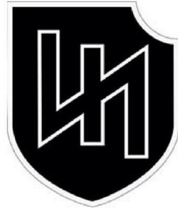
Emblem of the SS Division Das Reich.