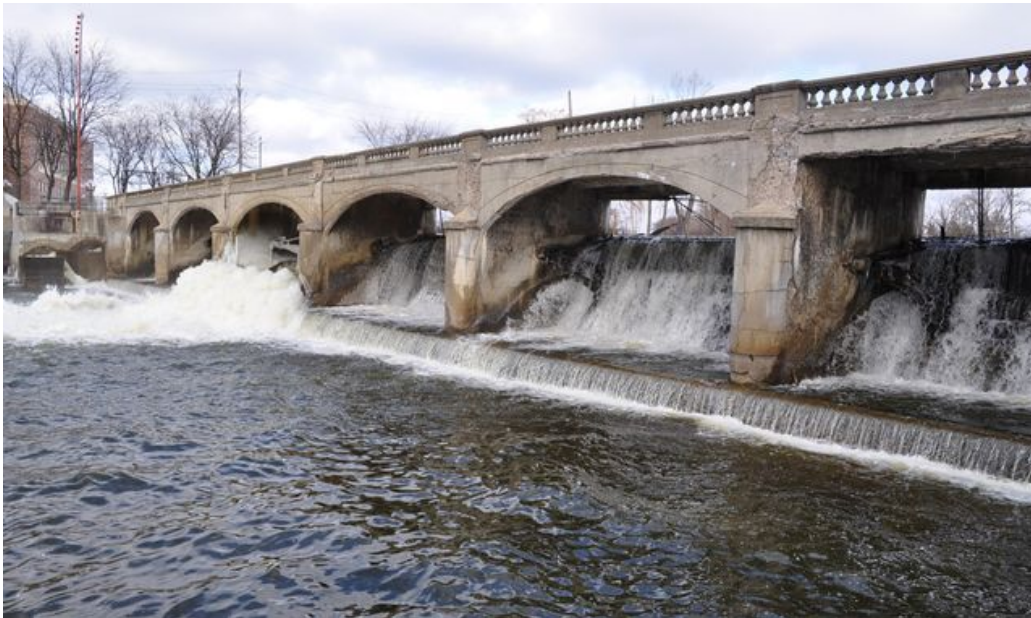
The Flint River

There has been a sharp decline in poisoning since lead was removed from paint in 1976 and gasoline in 1995, the latter after more than a decade of resistance by the oil industry. The elimination of lead poisoning, however, is not possible due to lead pipes, residual lead paint in poor urban and rural areas, and former or current industrial sites polluted with lead.