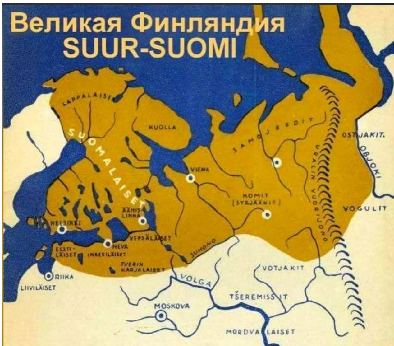
A World War 2 era map showcasing the most radical version of 'Greater Finland' ideology that saw

In the aborted Russia-Finnish Mutual Security Treaty, Russia offered to cede South Karelia in the north in exchange for the Soviet border moving westward on the Karelian Isthmus and permission to station Russian bases in Finland. The pro-German government of Ryti and Mannerheim had publicly been cozying up to the Germans during the 1930s and much of Finland's aristocracy had entertained delusional visions of expansionism along with their Swedish pro-Nazi counterparts believing that a major part of northwestern Russia called East Karelia apparently contained a "pure" Nordic people untainted by both Slavic and Scandinavian blood.