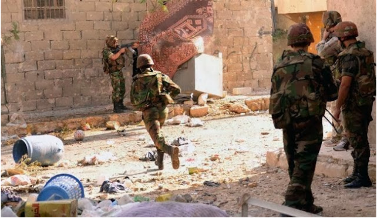
Image: The Syrian Arab Army is decisively winning the the war through conventional means and would only invite the one possible method of changing that, foreign invention, through the use of chemical weapons. Commonsense, the evidence, and even the liars who would say otherwise, all point to NATO-backed terrorists as the culprits behind chemical weapon use in Syria's ongoing conflict.