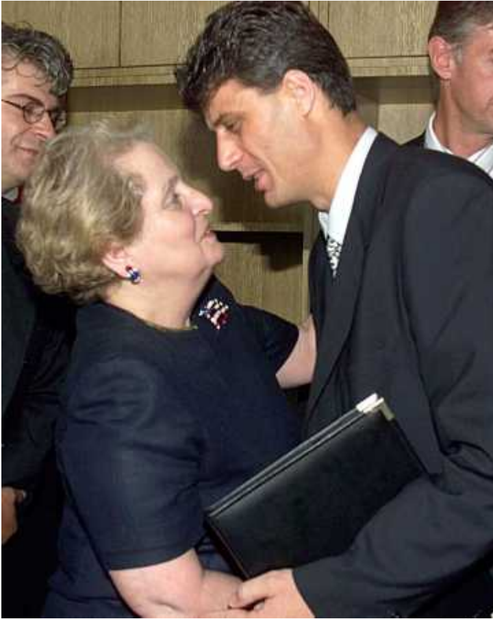
Albright and KLA leader Hashim Thaci

While negotiations were ongoing in Rambouillet, NATO decided to increase the readiness of its assigned forces “so as to make them able to execute the operation within 48 hours”. 46 In other words, “peace negotiations” had been initiated in Rambouillet (contrary to the Vienna Convention) under the threat of impending air strikes. NATO had granted a three weeks period to the parties meeting in Rambouillet to conclude negotiations.