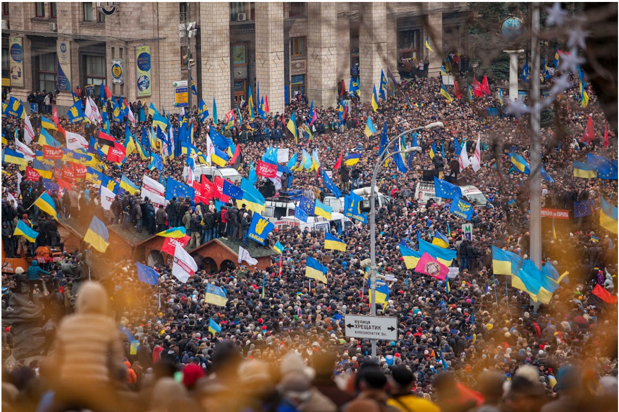
Image: Laying to rest any lingering doubts, images from “Euromaidan” rallies were frequently dominated by the yellow and blue Svoboda Party flags, featuring a three-fingered salute, intermixed with EU flags, and flags of Ukraine’s other ultra-right, Neo-Nazi parties, including the “Fatherland Party,” and Right Sector’s crimson and black banners.

As the regime in Kiev prepares a violent “anti-terror” campaign to subjugate eastern Ukrainians who wholly reject the unelected regime’s seizure of power and its deliberate intimidation and deconstruction of their political rivals ahead of rushed elections, the savage beating of Oleg Tsarev by the regime’s supporters must be kept in mind. It is these very tactics by the regime that is driving opposition across much of Ukraine’s eastern and southern regions, including Crimea which has already decided upon and begun the process of integrating with Russia rather than remain under literal Neo-Nazis occupying Kiev.