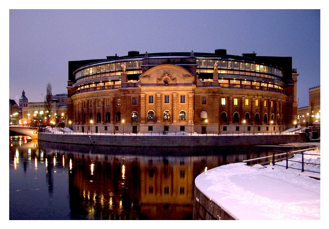
The Riksdag building.

Moscow's modern hypersonic missile, according to President Joe Biden, is currently "almost impossible to stop." It is said that Russia's new RS-28 "Sarmat" — a missile equipped with 10 to 15 MIRVs — can reach Berlin in about 106 seconds, London 202 seconds and Stockholm in 87 seconds.